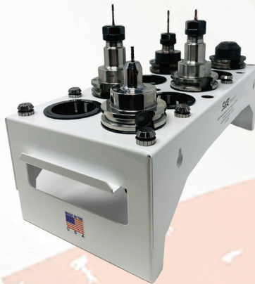
TOOL HOLDER ORGANIZER