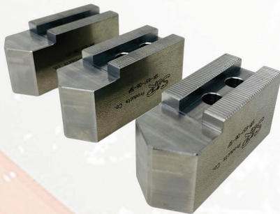
LATHE CHUCK JAWS