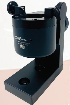
TOOL CHANGER FIXTURE