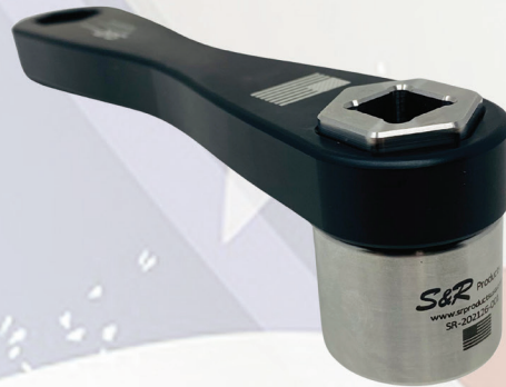
RETENTION KNOB HANDLE & SOCKET SET